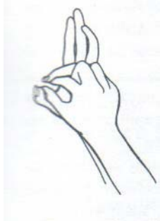
Negative response – NO